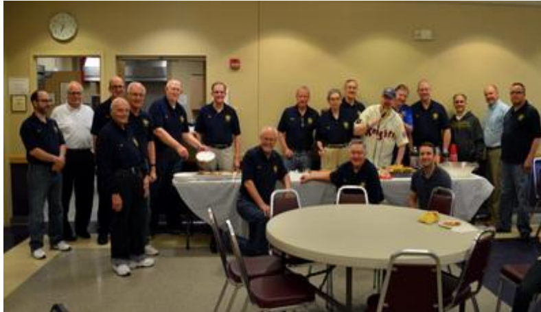
The Knights that helped with the party last year.